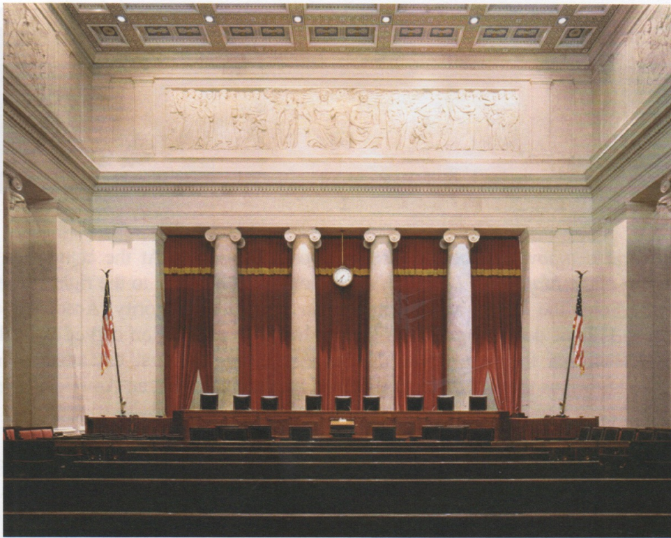
The Courtroom, c. 1998, showing the location of the East Wall Frieze above the Bench.

Flanking these two figures are representations of Wisdom , to the left, with an owl perched on his shoulder, and Truth , to the right, holding a mirror and a rose. Moving to the left from the central figures are the “Powers of Good”: Defense of Virtue , Charity , Peace , Harmony , and Security . The “Powers of Evil,” moving to the right from the central group, are: Vice and Crime , Corruption , Slander , Deception , and Despotic Power .