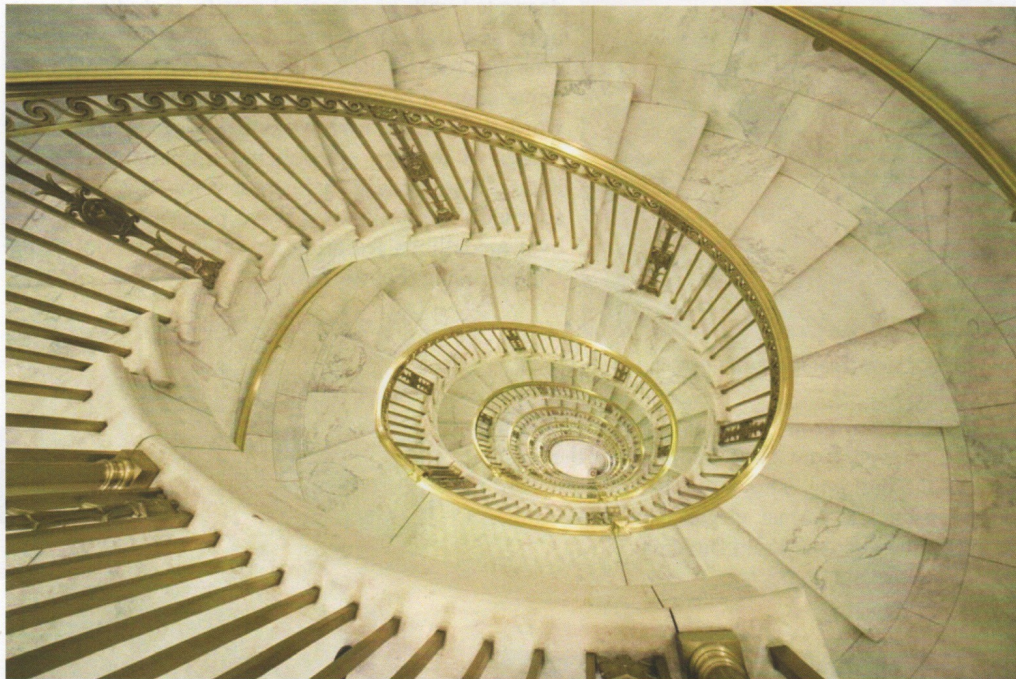
Looking down from the third floor.

Among the interesting architectural features of the Supreme Court Building are two, self-supporting, elliptical marble staircases. Whether Cass Gilbert, the building's architect, chose to include them for practical reasons or simply for their visual beauty is not known.